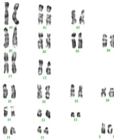
Figure 2: GTG-banded karyotype of domestic female cat