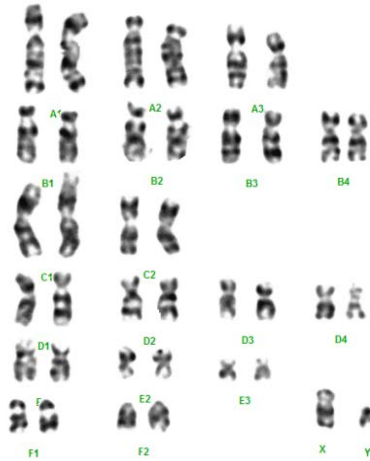
Figure 1: GTG-banded karyotype of domestic male cat