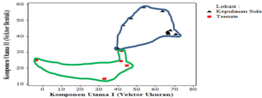
Figure 3: Diagram of the size and body shape of Walula Sula and Walik Tanah Ternate

These results show that both bird species, in terms of morphometrics, just have a number of similar components. The diagram above shows that in terms of shape vector and size vector, walik sula ( Ptilinopus mangoliensis ) is larger than walik tanah ternate ( C. indica ), which is thought to be influenced by not only genetic factors but also feeding habits, where walik terrestrial food was constantly disturbed by humans and land predators.