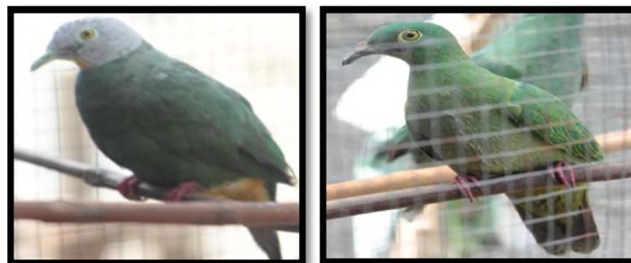
Figure 4: Walik Sula ( Ptilinopus mangoliensis ), male (on the left), female (on the right)

Based on the samples of Walik sula and Walik Tanah Ternate observed, the difference of feather color variation on both species can be clearly seen as shown in the following picture.