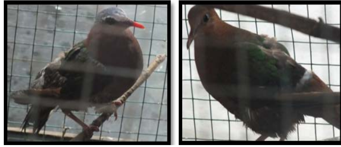
Figure 5: Walik Tanah Ternate ( Chalchophaps indica ), male (on the left), female (on the right)

Based on the qualitative nature of the feather colors observed, obviously there are differences in the feather colors of each bird. Characteristics of qualitative properties of feather color can be seen in Table 13 below: