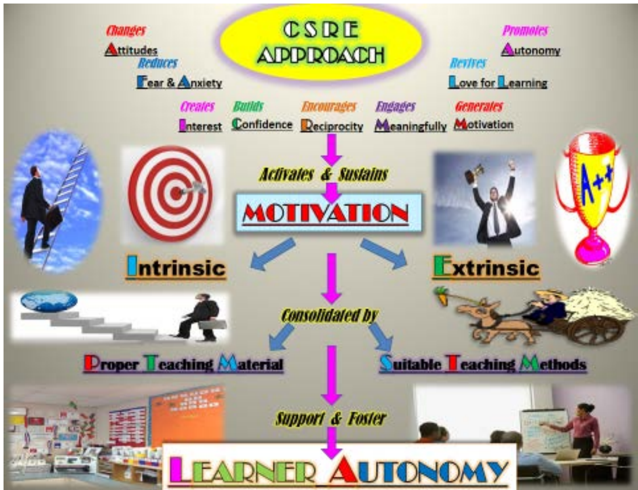
Figure 3:

materials and easy-to-understand teaching techniques. All these, in turn, support and foster language learning. Cook rightly remarks, “It is the learners’ involvement, the learners’ strategies, and the learners’ abilities to go their ways that count, regardless of what the teacher is trying to do [25].”