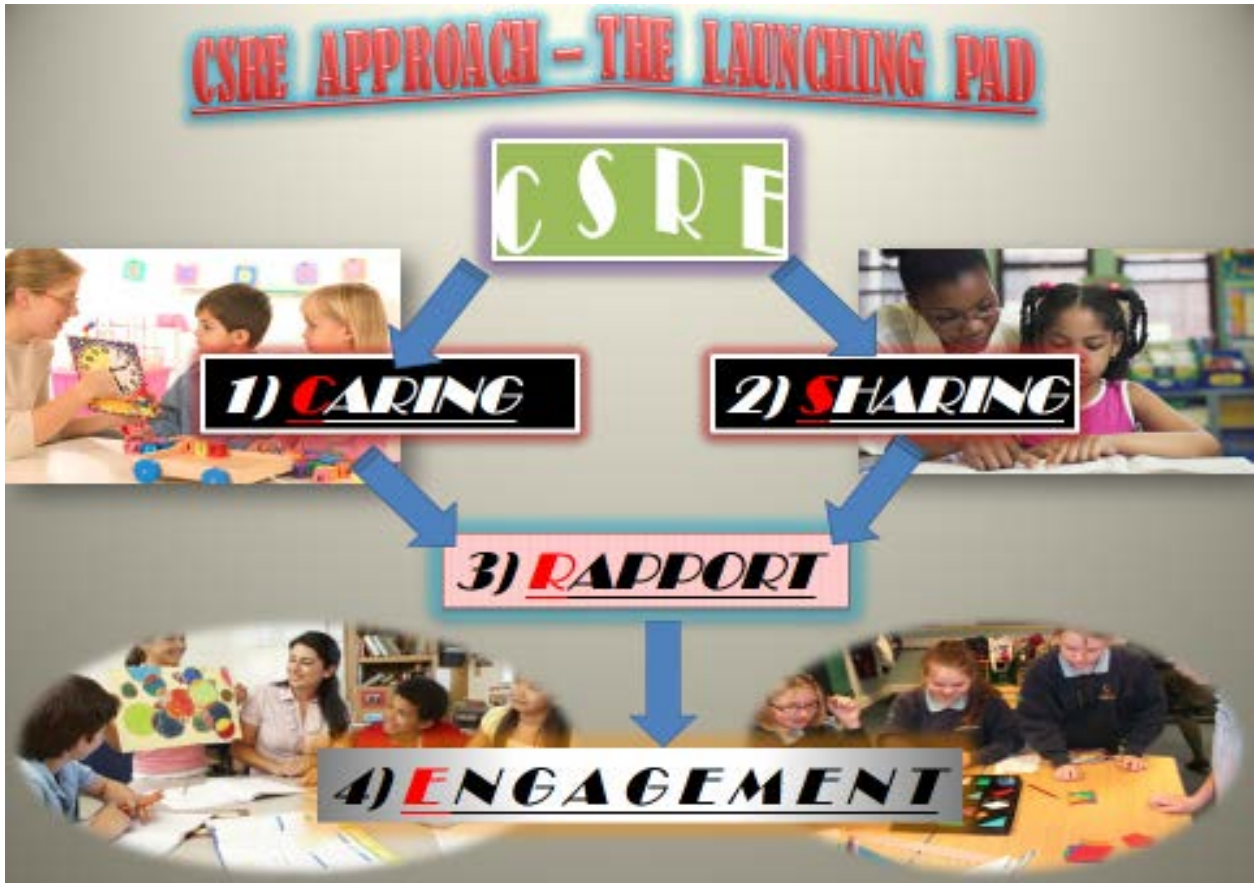
Figure 1: Courtesy: Google images