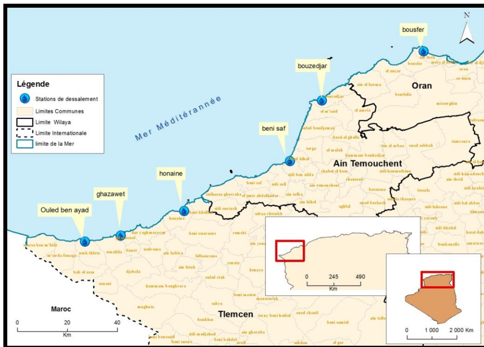
Figure 2: Main seawater desalination stations

There are also several beaches, very popular during the summer season. This important human activity generates serious disturbances of the coastal ecosystem. An environmental monitoring program must be rigorously put in place to preserve these vulnerable coastal areas, and our investigations confirm Djad's work carried out between 2010 and 2015 [1]. Liquid household waste has the highest proportion on the coastal strip. Others are channeled