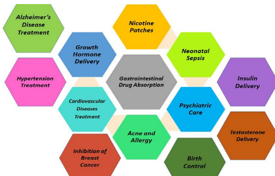
Figure 2: Aptness of Transdermal Patches accounting different health disorders

Nicotine patches are customarily in practice to reduce the nicotine addiction in those persons who smoke loads of cigarette about twenty a day. In combination therapy, varenicline is also accounted along with these patches [25, 26].