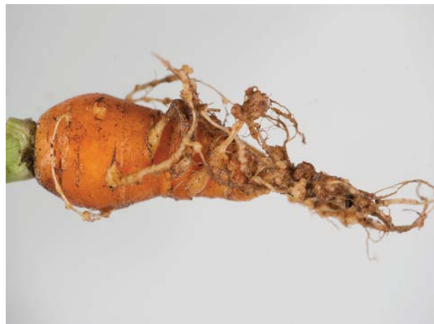
Figure 2: Symptom of Root knot nematodes infection on carrot