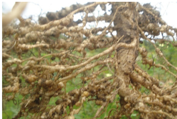
Figure 3: Root knot nematode induced galls on okra roots