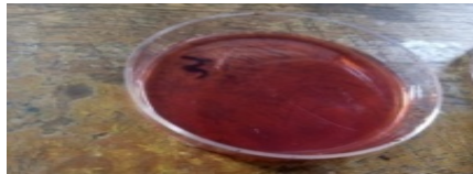
Figure 1: PCA appearance of vaginal discharge of mice before inoculation of intravaginal Gardnerella vaginalis (H0)

Figure 1 above shows that prior to inoculation of intravaginal Gardnerella vaginalis (H0) from vaginal secretions of Balb-C after culturing on PCA (Plat Count Agar) there was no colony growth. This means that the vaginal ecosystem of mice there is no growth of pathogenic bacteria.