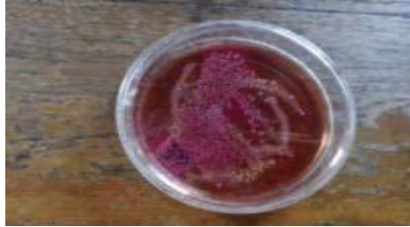
Figure 4: PCA appearance of vaginal secretions of mice 18-24 hours post inoculation of intravaginal Gardnerella vaginalis (H1) at concentration 3 \times 10^6

Figure 3 above shows that 18-24 hours post-inoculation of intravaginal Gardnerella vaginalis (H1) concentration of 3 \times 10^5 Balb-C vaginal secretions after culturing on PCA (Plat Count Agar) has colonies of 106 cfu / ml growth. This means that there is a change in the vaginal ecosystem of mice and the growth of pathogenic bacteria that increased more than the concentration of 3 \times 10^4 .