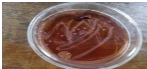
Figure 2: PCA appearance of vaginal secretions of mice 18-24 hours post inoculation of intravaginal Gardnerella vaginalis (H1) at concentrations of 3 \times 10^4

Figure 1 above shows that prior to inoculation of intravaginal Gardnerella vaginalis (H0) from vaginal secretions of Balb-C after culturing on PCA (Plat Count Agar) there was no colony growth. This means that the vaginal ecosystem of mice there is no growth of pathogenic bacteria.