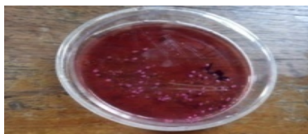
Figure 3: PCA appearance of vaginal secretions of mice 18-24 hours post inoculation of intravaginal Gardnerella vaginalis (H1) at concentrations of 3 \times 10^5

Figure 2 above shows that 18-24 hours post-inoculation of Gardnerella vaginal intravaginal (H1) concentration 3 \times 10^4 from Balb-C vaginal secretion after culture done on PCA (Plat Count Agar) there is a growth of 21 cfu / ml colony, meaning that there is ecosystem change Vaginal mice and growth pathogenic bacteria.