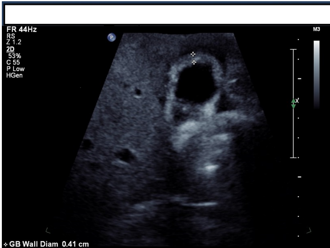
Figure 2: Ultrasound image of the gallbladder findings: thick walled gallbladder and cholelithiasis.