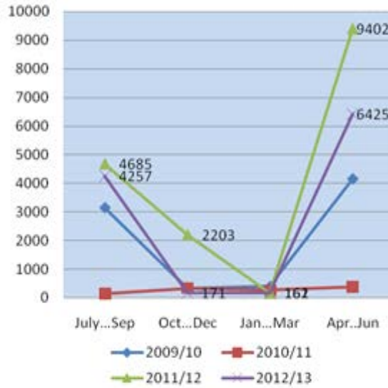
Figure 4: Tourist flow quarterly in each year (2009/10-2012/13)