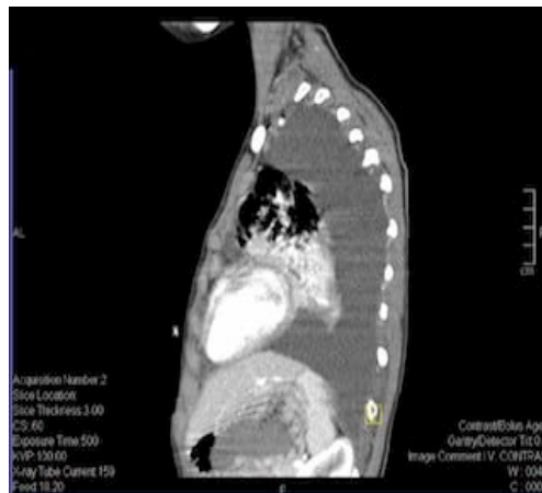
Figure 2b: Computed tomography (CT) scan of the chest, left lateral view, confirmed the presence of free fluid in the left pleural cavity and a collapsed lung.

Conservative management was performed, which included tube drainage (Fig. 3), diet control, and restriction of fat in the patient's diet for 2 wk until the drainage became minimal and the chest tube was removed (Fig. 4). The patient was discharged home in a stable condition.