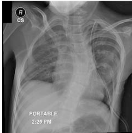
Figure 3: Chest radiography showed chest tube inserted in the left side of the chest for drainage.