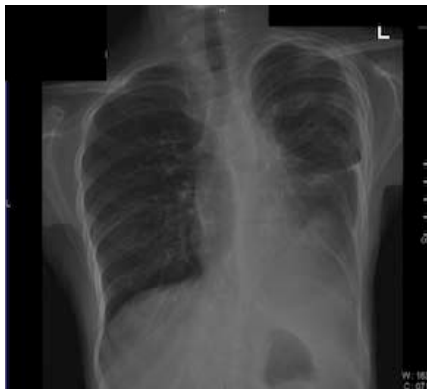
Figure 4: Chest radiography showed improvement in the left side of the chest, drainage became minimal and the chest tube was removed.