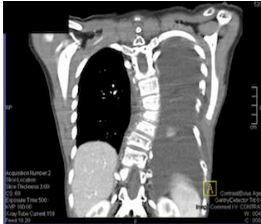
Figure 2a: Computed tomography (CT) scan of the chest PA view, confirmed the presence of free fluid in the left pleural cavity and a collapsed lung.