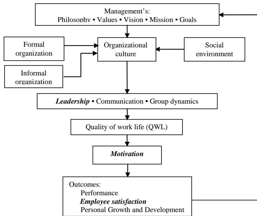
Figure 1: An Organizational Behavior System of Newstrom.

According to Newstrom, organizational culture is a set of values or norms that have been enacted long, recognized and followed by the members of the organization as a norm of behavior in solving organizational problems. Many factors influence organizational culture, among other things: philosophy, values, vision, mission, and objectives of management; and social environment. While the