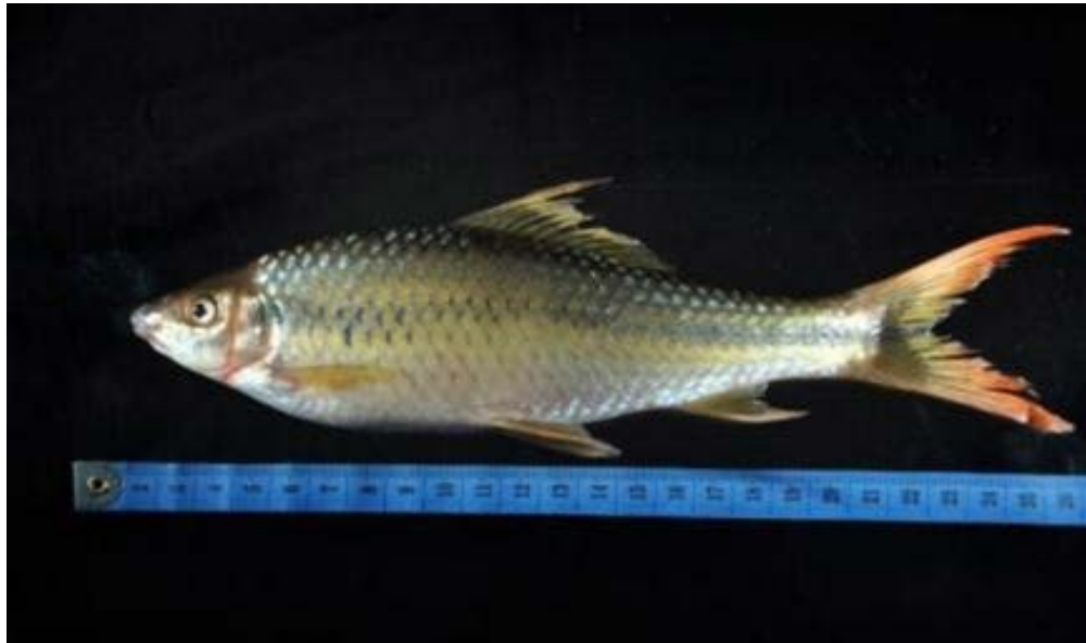
Figure 3: Fish of lelan ( D. pleurotaenia )

Measurement data of the body depth(TB) shows that the female were between 18.0-57.3 with the average of 36.57 mm, while the male were between 20.0-49.0 mm with the average of 35.20 mm. The high of caudal penducle (TBE) the female were between 9.0-24.4 mm with the average of 15.51 mm, while the male were between 8.0-20.6 mm with the average of 15.41 mm. The body width (LB)of the female were between 11.0-32.2 mm with the average of 19.83, while the male were between 11.0-28.1 mm with the average of 19.51 mm. The body high above the linealiteralis (TbaL) of the female were between 13.0-34.6 with the average of 22.68 mm, while the male were between 14.0-33.1 mm with the average of 22.52 mm. The body high under the lineliteralis (TBbL) were between 12.3-40.1 mm with the average of 19.83 mm, while the male were between 11.0-26.0 mm with the average of 17.92 mm. The other morphometric comparison can be seen in the Table 2.