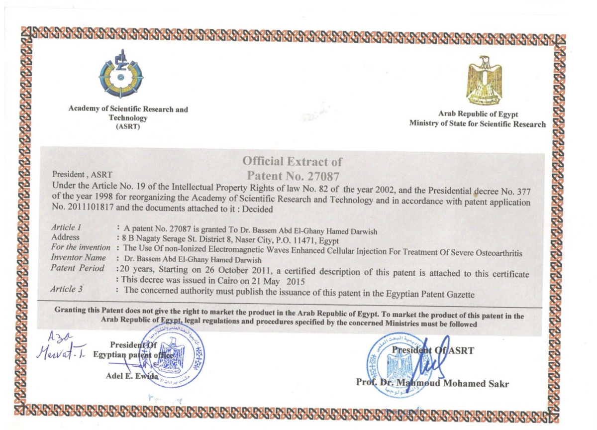
Figure 1: official extract of patent 27087

According to the procedure described in patent number 27087 EPO [5] & [6]. See Figure 1.