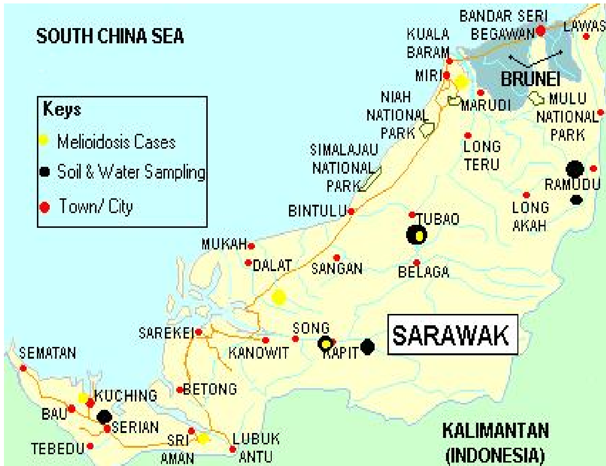
Figure 3: Map showing reported cases of melioidosis and soil samplings for Burkholderia in Sarawak

was within two kilometers from the logging camps. The cut timber were transported by helicopter to the landing area ready to be loaded onto a lorry near the base camp. At the landing area, the helicopter took a resting cycle every hour for 30 minutes without stopping the rotor while the engineer did the inspection. This would cause further disturbance on the surface soil due to strong turbulence generated from the rotor. Four of the seventeen logging workers were exposed to B. pseudomallei during the study. They included the loadmaster who was at the logging site during the operation. However, the potential risk of causing the disease would depend on the concentration and the virulence of the bacterium in the environment, host immune status and the underlying disease in the host [8].