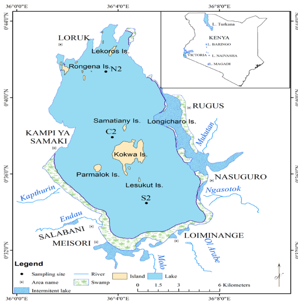
Fig 1. A map of Lake Baringo showing the sampling stations (from [3])

Fish samples were obtained from Lake Baringo, Kenya a shallow equatorial freshwater lake with a surface area of approximately 137 km 2 located in the eastern arm of the Rift Valley, Kenya. The lake lies between 0° 32' and 0°45' N, 36° 00' and 36°10' E at an altitude of 975 m above sea level. Lake Baringo has no surface outlet, with its 'freshness' being attributed to the presence of an underground outlet at its northern end [18]. The surface covers approximately 130 km 2 [19]. This lake is characterized by dry and wet season. The dry season starts from September to February while the wet season starts from March to August [19].