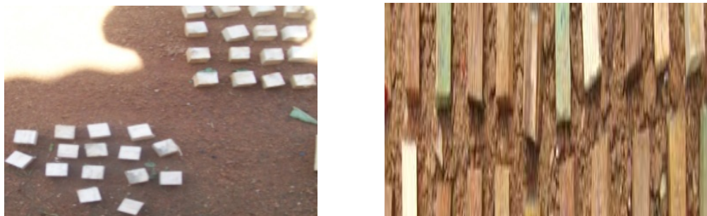
Figure 2.1(a). Samples being air dried (b) Samples after painting for easy identification