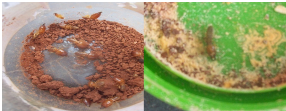
Figure 2.3 Some termites that were collected from the field