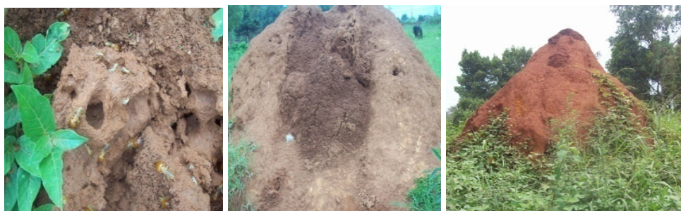
Figure 2.2. Active termite mounds found in the field site

In order to determine weight loss, the test specimens were then exposed to termites in the field for a short duration. The short duration field test method (32 days) was preferred because it offers a fast field test for screening of promising lesser known timbers against termites [13]. In addition, field tests were preferred to laboratory studies because they allow the collective and cumulative effects of all kinds of abiotic and biotic deterioration factors to be evaluated [5]. They also give reliable data regarding natural resistance of wood [15]. The field site was Olobai village, Kisoko county in Tororo district an area where termite infestation was detected earlier in preliminary studies [16]. The wood samples were buried randomly 150mm into the ground 12 meters away from the active termite mounds (Figure 3.2) but in an area with termite tunnels [13, 17] for 32 days during the dry months of July and August. This is the period when termites are most active.