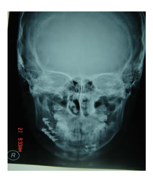
Fig. (1) PA.view ,bilateral fractures of mandible treated by mini plate 2.0mm/screw system ,group 1.