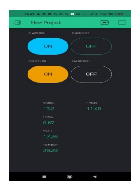
Figure 3: Screenshot of the Blynk Application on a Smartphone

From figure 3, The ON/OFF top button is for activate and deactivate the charger relay manually. While the ON/OFF buttons below it is for activate and deactivate the inverter relay. The smartphone also displays data during charging, that is the value of the panel voltage, panel current, panel power, battery temperature and battery voltage. From the results above, it can be stated that the IoT test, namely monitoring the voltage parameters, has been successfully carried out.