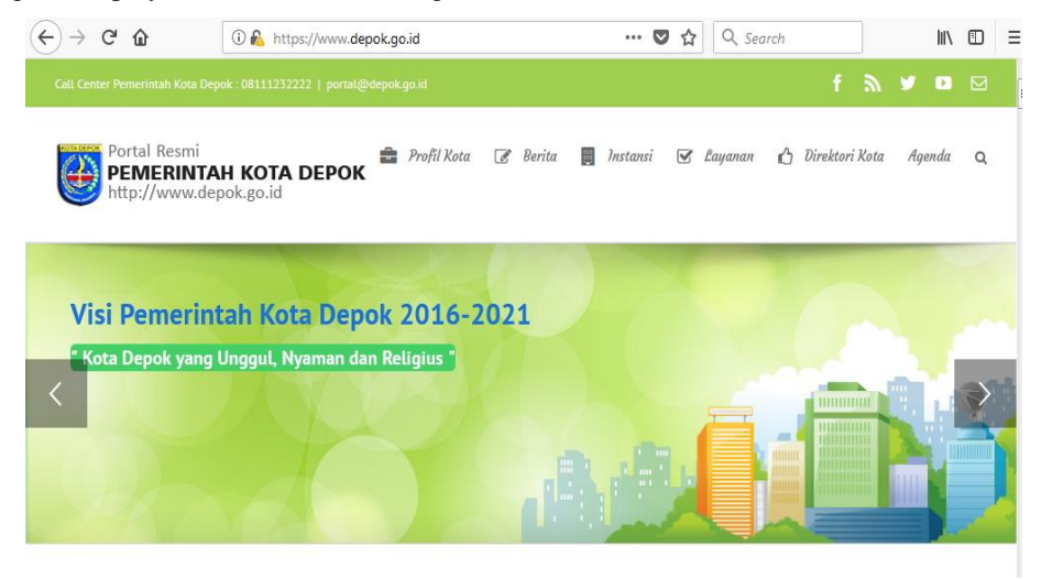
Figure 1: Main Page of the Depok City Government Official News Portal

www.depok.go.id provides access to information, services, and others -other. At this stage the local government website can display information about local government, especially at the emergence stage by introducing various information related to local government. The official website / portal of Depok City via www.depok.go.id displays information, including: