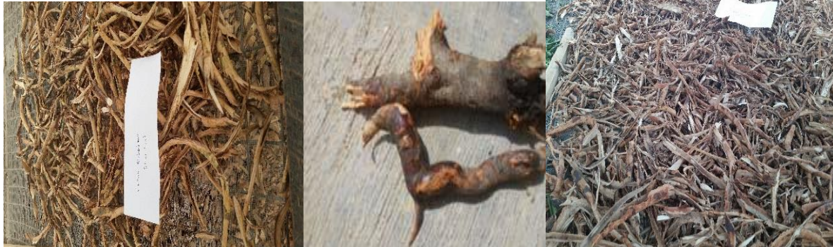
Figure 4: Stem bark (CPMR Arboretum)