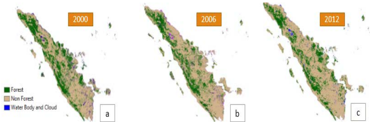
Figure 3: The map of land cover using supervised classification from Terra MODIS ( MOD13Q1 ) imageries year 2000 (a), 2006 (b), 2012 (c)

vegetation index product (MOD13Q1) in the Dry Chaco ecoregion of South America had an Overall Accuracy of 79.3%, producer's accuracy from 51.4% (plantation) to 95.8% (woody vegetation), and user's accuracy from 58.9% (herbaceous vegetation) to 100.0% (water).